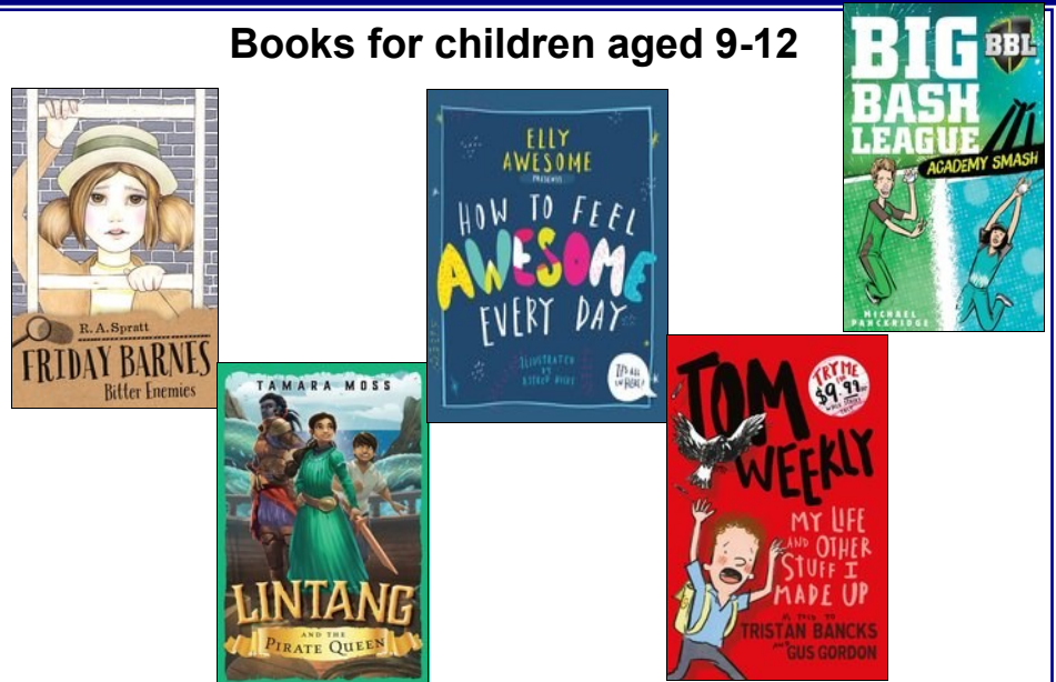
Books for children aged 9-12