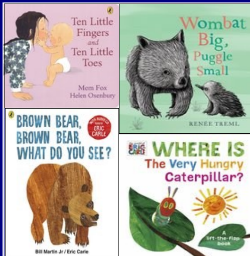
Books for children aged 3-6